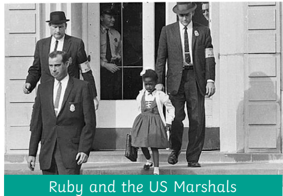
Ruby and the US Marshals

In 1960, Ruby was six years old. She started at William Frantz Elementary School. It used to be a school just for white children, but now things had changed. The school was close to her home, but Ruby had to travel by car with her mother. American police officers, called Marshals, helped them to get into school safely and quickly. There were many people protesting because they were angry about desegregation.