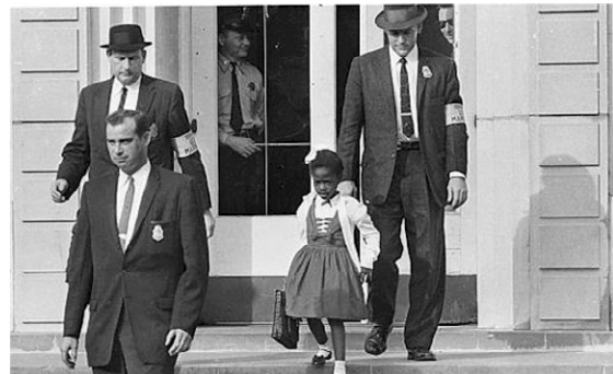
Ruby and the US Marshals

Ruby passed and was able to join the previously all-white William Frantz Elementary School. It was conveniently within walking distance of her home. However, for the first year of school, Ruby had to be driven there and helped into the building by US Marshals (a type of police officer). The reason was that many local