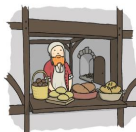
WALT: To understand the causes and consequences of the Great

The famous 'Great Fire of London' started on Sunday the 2 nd of September 1666 in a baker's shop on Pudding Lane. The baker was called Thomas Farriner.