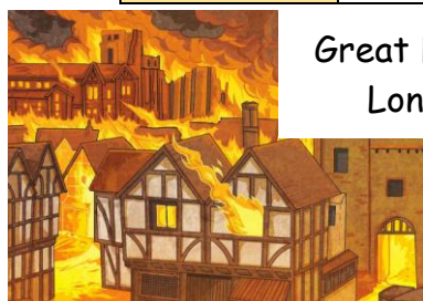
Great Fire of London