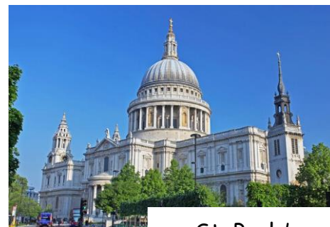
St. Pauls' Cathedral